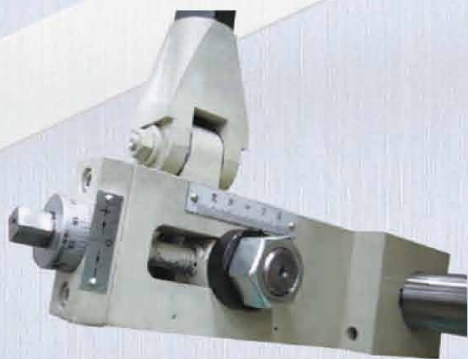
Micro Adjustment 微調裝置